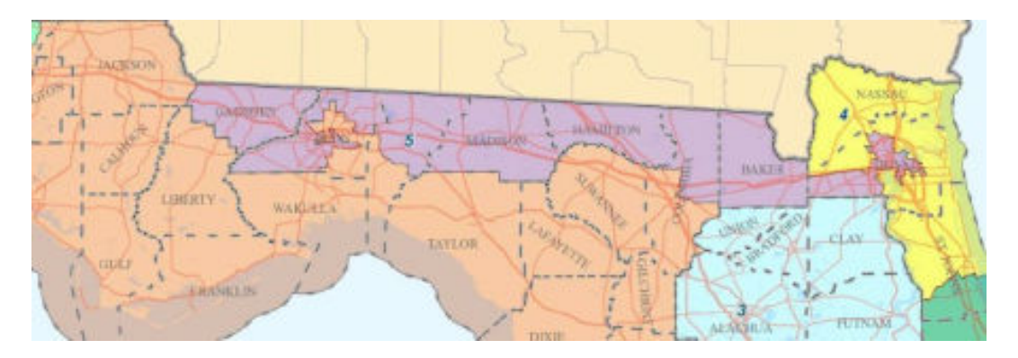
Benchmark CD-5, as Approved by the Florida Supreme Court.

In 2012, however, the Legislature misused the FDA to pack Black voters from Jacksonville to Orlando into a single district. As a remedy, the Florida Supreme Court required the creation of Benchmark CD-5—a district with an East-West (Jacksonville-Tallahassee) configuration along Florida's northern border—to replace the Legislature's North-South (Jacksonville-Orlando) district. It found that the North-South orientation "overpacked black voters" and thereby "dilut[ed] [their] influence ... in surrounding districts." Apportionment VII at 402. Based on voter registration and election data, the Court concluded that an East-West CD-5 would afford Black voters a "reasonable opportunity to elect a candidate of [their] choice." Id. at 405. And, indeed, that district elected Black voters' preferred candidate in 2016, 2018, and 2020: Al Lawson, a Black candidate.