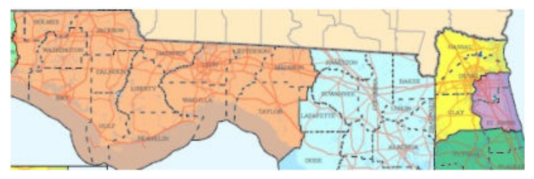
The Governor's Third Proposed Map, as Enacted into Law.

On April 13, the Governor submitted his third and final map, which was ultimately enacted into law (the "Enacted Plan"). (PX 7190). It took Benchmark CD-5's Black voters and dispersed them across the newly configured CDs 2, 3, 4, and 5—which are whiter, richer, and more educated than Benchmark CD-5.