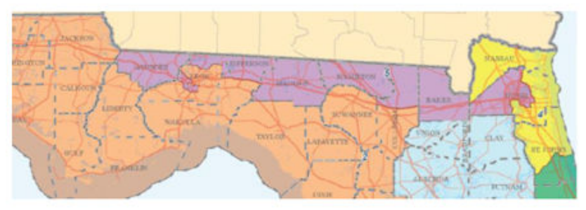
Prior, Non-Black Opportunity Districts in North Florida Had Similar Shapes.

Meanwhile, the Governor ignored the Legislature's conscientious effort to improve Benchmark CD-5. By design, the modified version contained in the Legislature's backup plan was more compact than Benchmark CD-5; more compact than CD-2 in the 2002 plan; and more compact than any alternative district that had been proposed at the time of CD-5's creation. (JX 0038-0045-48, Tr. 45:9-48:9 (2/25/23 House Redistricting Comm.) (Chair Sirois describing how CD-5 in Plan 8015 complied with both Tier I and Tier II, improving compactness and compliance with political and geographic boundaries)); BVM at 7-8. By ignoring all this, the Governor treated the Legislature's hard work with disdain—more evidence of pretext.