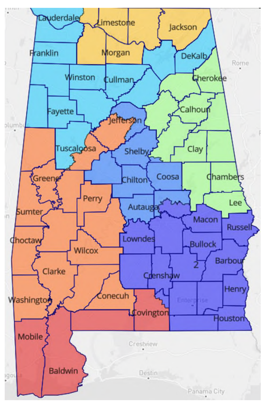
Act 2023-563 Plan