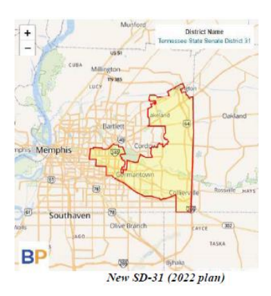
Dkt. 1 ¶¶ 113, 151. The challenged maps simply lack "lines of a dramatically irregular shape," Shaw , 509 U.S. at 633—the hallmark of gerrymandered districts.

Because these maps are not unusually shaped, Plaintiffs fall back on their allegation that the General Assembly "was well aware" that the proposed maps would "adversely impact Black voters" yet still "forg[ed] ahead" by enacting those plans anyway. Dkt. 1 ¶¶ 3–4. That is a statement of a winning case for the defendants, not a plausible one for the Plaintiffs. The required intent is not mere "volition" or "awareness of consequences." Pers. Adm'r of Mass. v. Feeney, 442 U.S. 256, 279 (1979). Plaintiffs instead must show that a legislature passed a law "because of," not merely 'in spite of,' its adverse effects upon an identifiable group." Id. After all, "when members of a racial group live together in one community, a reapportionment plan that concentrates members of the group in one district and excludes them from others may reflect wholly legitimate purposes." Miller, 515 U.S. at 920 (quotation omitted). In the redistricting context, a partisan motive to improve Republican prospects is the same as one that adversely impacts those for Democrats. Given the current political reality regarding the correlation between Black voters and Democratic voters, awareness of this impact plausibly suggests absolutely nothing about any improper racial motive.